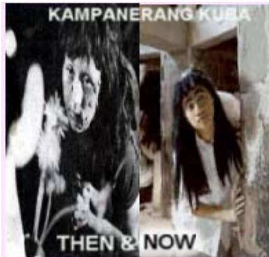
Angel Locsin and Ann Curtis are in a very hot seat trying very hard to surpassed Vilma Santos record as the most successful Darna and Kampanerang Kuba, this time on small screen.