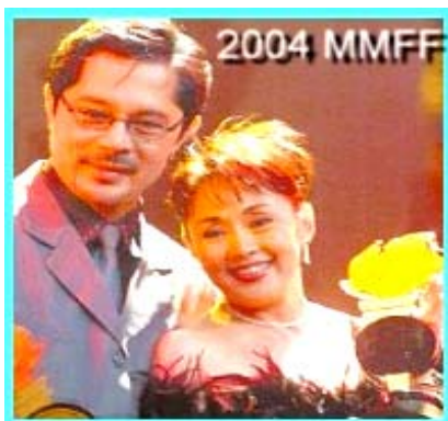
Christopher De Leon and Ate Vi at Last year's Metro Manila Film Festival